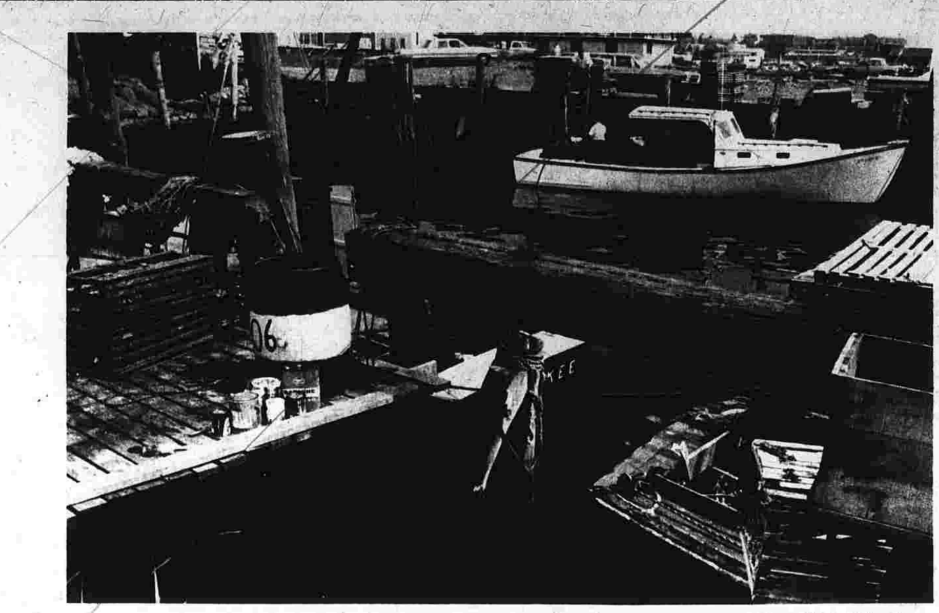
MOORINGS, STONINGTON

Montaigne Unretrieved It has indeed been a torturous experience for President Charles de Gaulle, trying to chart himself precisely the right path during his exposure of himself and his wisdom to the people of Canada.